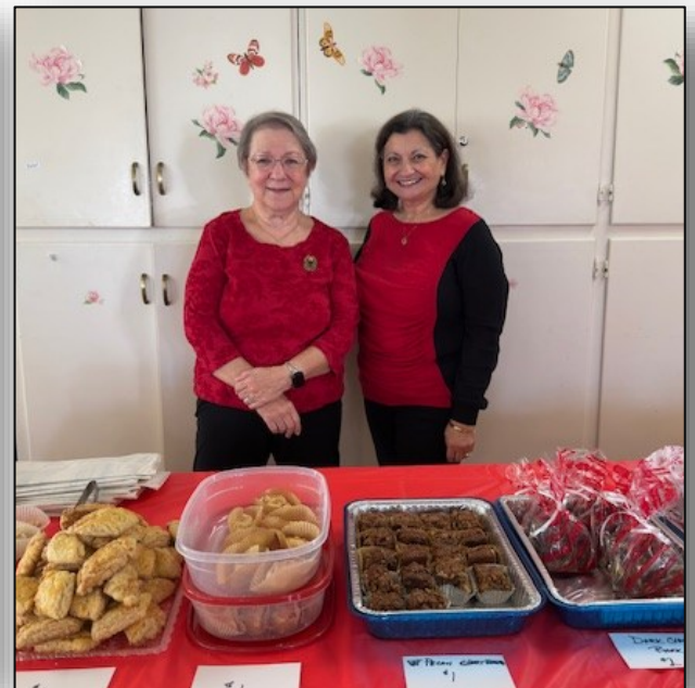
Ladies Aid Annual Christmas Bake Sale December 21, 2025