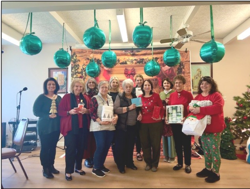
Women's Spiritual Fellowship Bible Study and Christmas Party, December 20, 2025