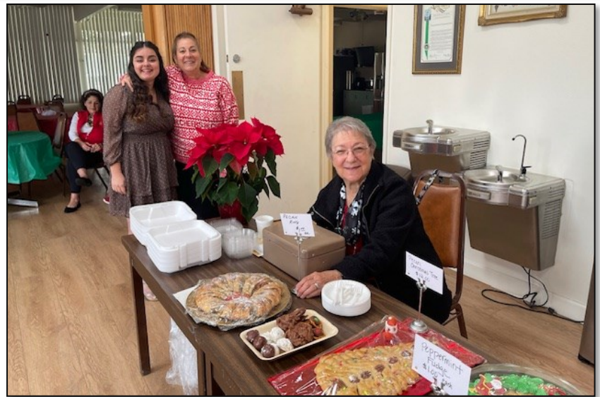
Ladies Aid Bake Sale